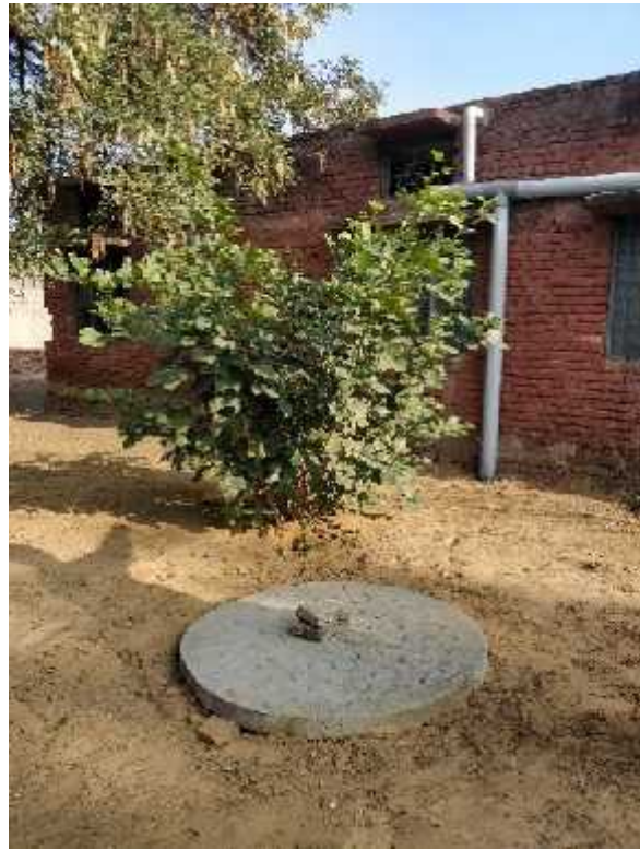
Before and after maintenance image of Rainwater Harvesting Structure installed at Government High School in Garhi Harsaru