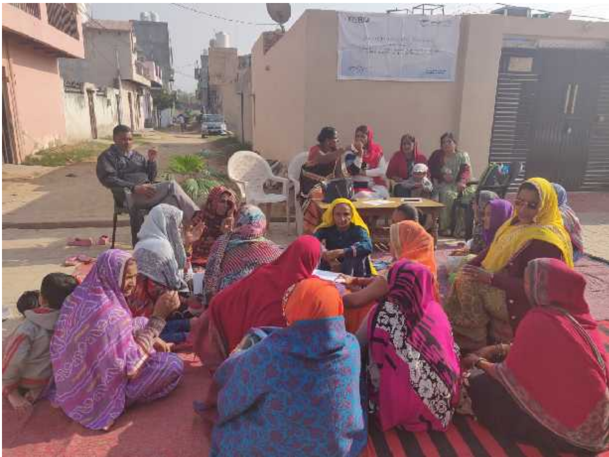
Event of Swachh Gully Award

The Swachh Committee members along with the Taru team were involved in inspecting the gullies by conducting a transect walk in 6 major gullies. On the basis of the aforementioned criteria- Gully no. 2 (ward 18) and Gully no. 4 (ward 20) were shortlisted and their respective ward members were felicitated with a certificate given to them by the Sarpanch. Also, community bins and potted plants were given as a token of appreciation for the efforts undertaken by the ward and community members in ensuring that their gully was the cleanest.