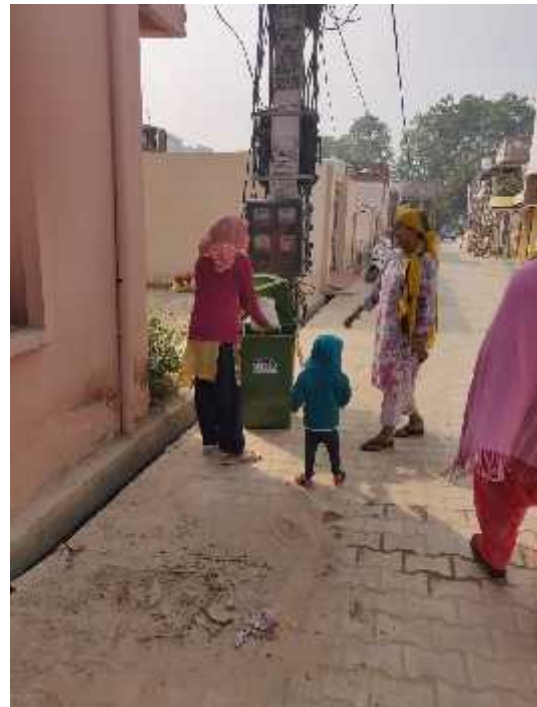
Potted plants and Community dustbins as award incentive