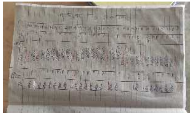
Cashbook and Attendance register