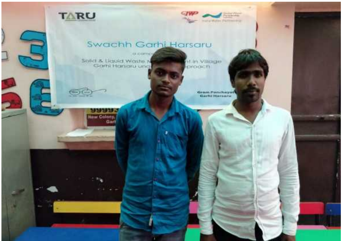
Cleaning staff appointed by the Sarpanch

Since it is a community driven project, therefore the roles and responsibilities of the cleaning staff was designed after discussion with the community members. As per this, the cleaning staff would be responsible for: