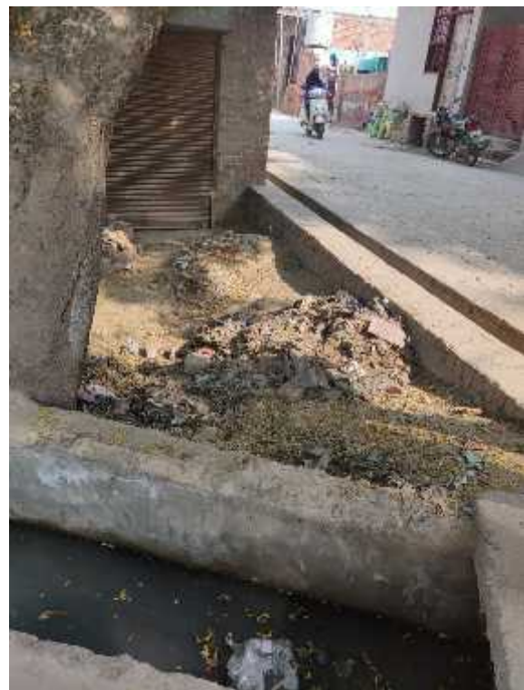
Door to door waste collection and cleaning of drains

It was decided that the entire waste management system would be monitored regularly by the Swachh Committee (SC). The SC would hold monthly meetings in order to discuss about the challenges being faced on the ground in terms of SWM and how can they be addressed.