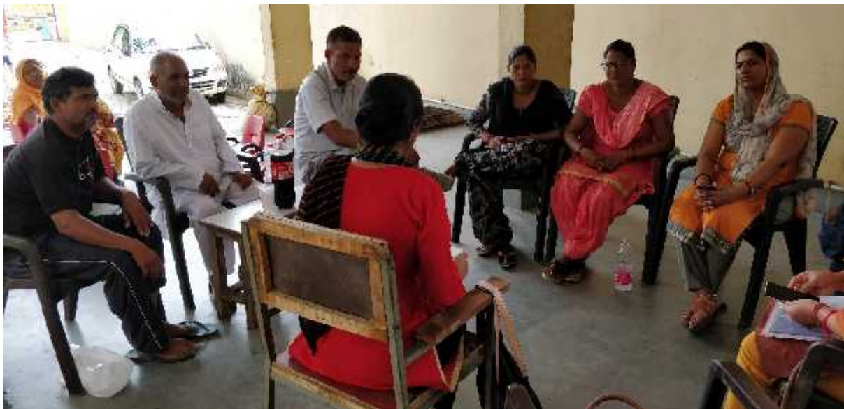
Focus Group Discussion for ward selection

On the basis of a Focus Group Discussion conducted with the ward members and the Sarpanch, three wards were shortlisted – 17, 18 and 20. These wards have a total number of approximately 230 households. This was followed by the launch of the Clean Garhi Harsaru or Swachh Garhi Harsaru campaign.