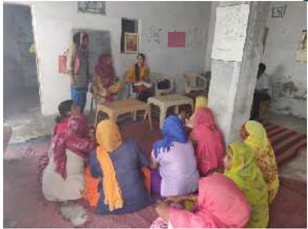
Regular meetings with the committee and community

Panchayat printed a User Fee booklet and the SC members would maintain a register of the amount of user charges collected as well as the attendance of the cleaning staff.