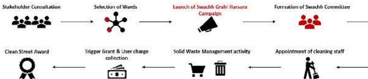
Activities involved in Swachh Garhi Harsaru Campaign

On the basis of a Focus Group Discussion conducted with the ward members and the Sarpanch, three wards were shortlisted – 17, 18 and 20. These wards have a total number of approximately 230 households. This was followed by the launch of the Clean Garhi Harsaru or Swachh Garhi Harsaru campaign.