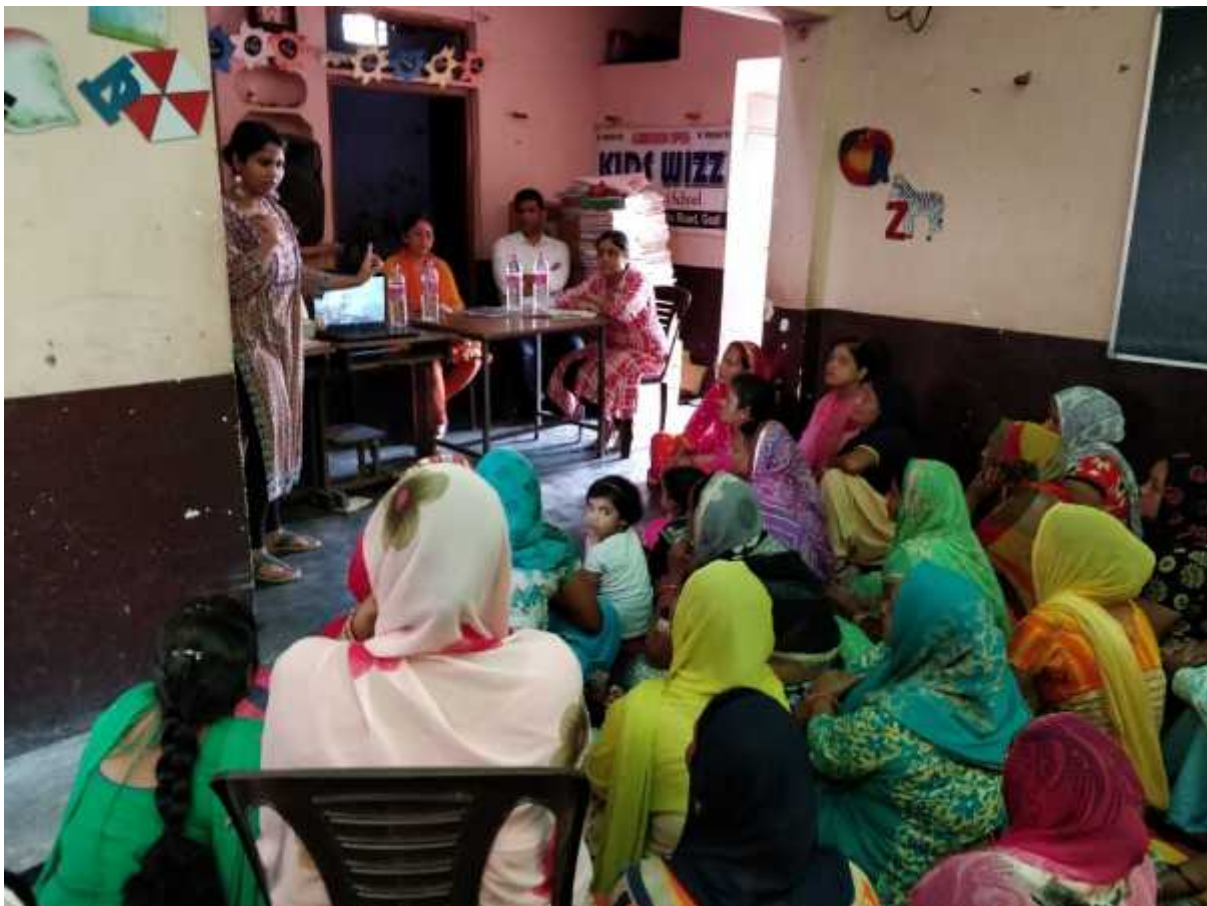
Awareness generation on solid waste during launch of the campaign