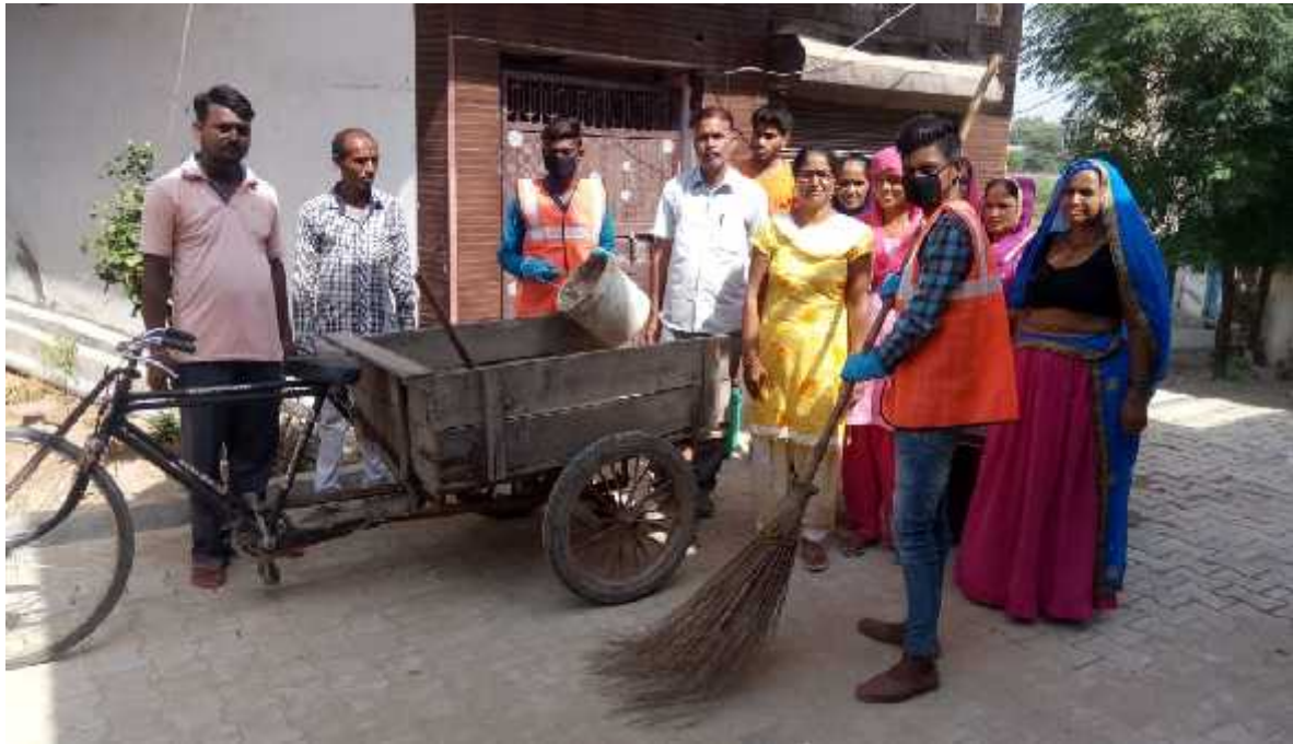
Start of the waste collection activity in selected wards