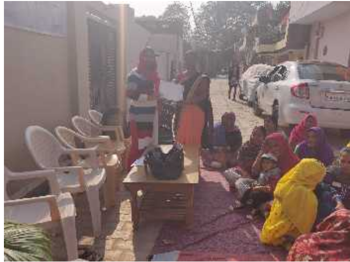
Evaluation and award of Swachh Gully Award to ward members of Ward 18