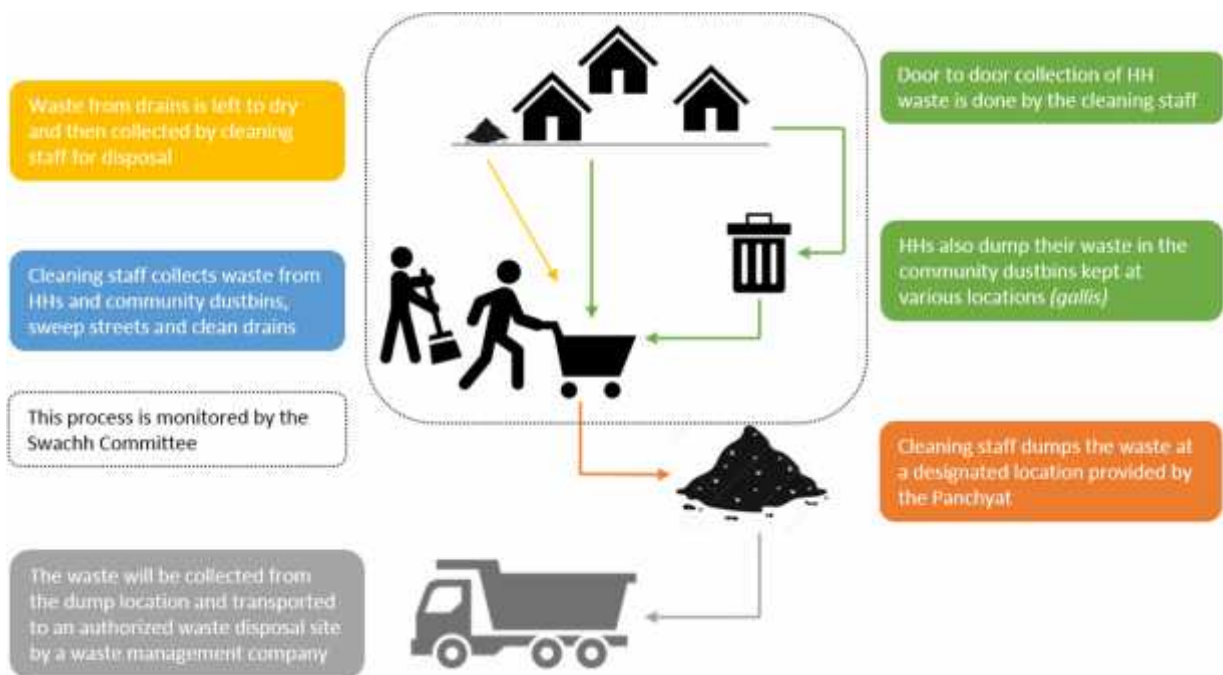
Process of Solid Waste Management Activity