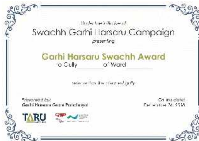
Certificate for Swachh award