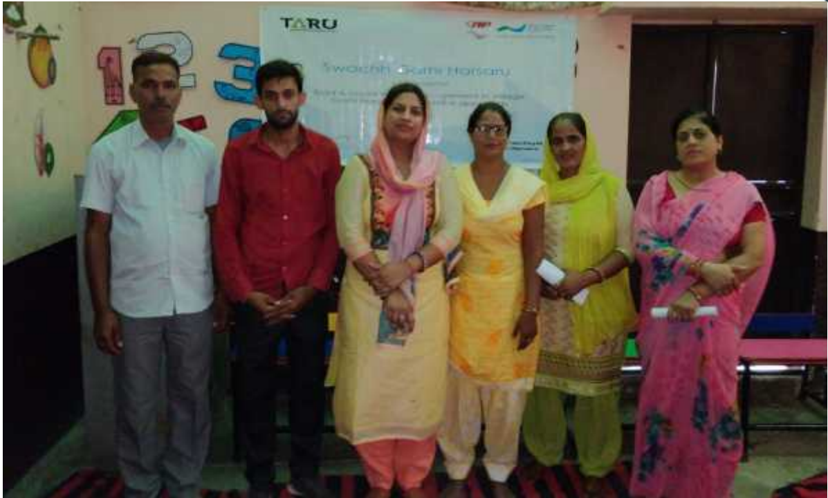
Members of Swachh Committee