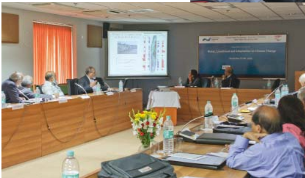
RTC participants during Inaugural & Technical Sessions