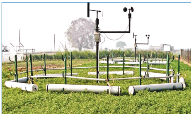
Controlled Environment facilities at IARI used for Evaluating Model performance in Future Climate Change Scenarios

Dr Aggarwal projected the impacts of climate change on agriculture which are: (a) Increase in CO 2 to 550 ppm increases yields of rice, wheat, legumes and oilseeds by 10-20%; (b) A 1°C increase in temperature may reduce yields of wheat, soybean, mustard, groundnut, and potato by 3-7%; (c) Productivity of most crops to decrease marginally by 2020 and