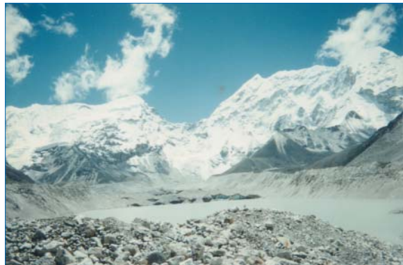
View of the Melting Himalayas

In Nepal, melting Himalayas have been the most highlighted issues of climatic changes. Its impacts on water resources are a concern not only in Nepal but also in South Asia and Southeast Asia. Major rivers of the region, such as the Ganga, Brahmaputra, Indus, Irrawadi, Salween and Yangtze originate from the Himalayas.