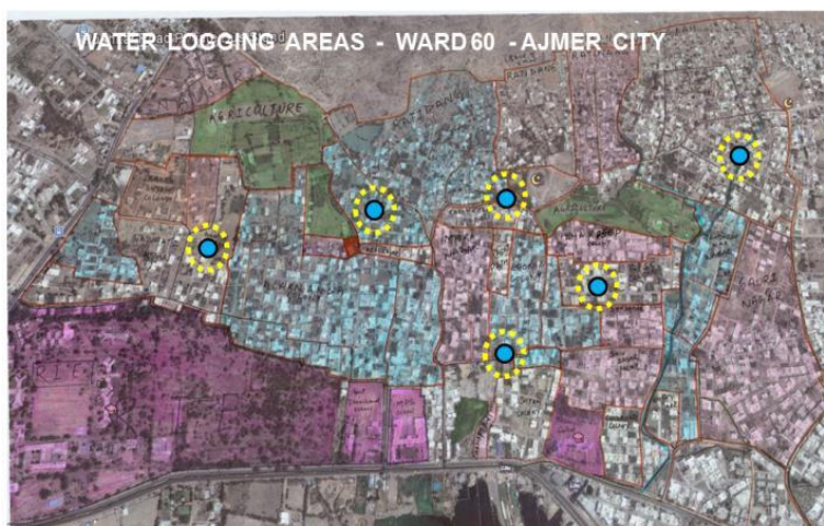
Figure 1 Waterlogging areas in Ward 60

The water logging areas within the ward 60 were identified by the stakeholders in consultation with the local ward councillor and local residents. Potential sites for the pilot project implementation were also selected and mapped.