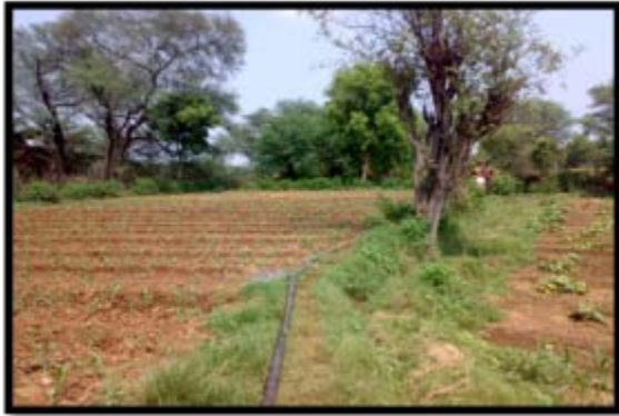
Main pipe of drip irrigation field