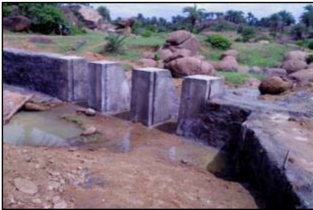
Check dam under construction check dam

To improve the crop production in 100 acres of land for 48 farmers belonging to ST category in the village Baghakol, Block Poriyahat, District Godda, a technical feasibility study was conducted by AFPRO. An alternative site was selected that could provide flow irrigation to the area. The proposed site has catchment area of 24 Km 2 (as per information provided by the village people). By conducting systematic site selection, river water is utilized to provide gravity flow irrigation to a large area of agricultural land. A check dam was construction to enable gravity flow system, so that water could reach the field. Approximately 100 acres of agricultural land is receiving irrigation facility from this structure. People are also saving from non-use of diesel operated pump sets, which they were using earlier. The available water is sufficient for taking to take two crops in a year.