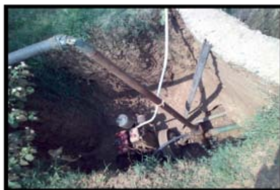
8 HP diesel