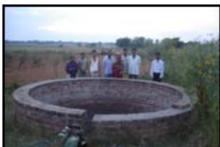
Well of Phagu Oraon, Village-Choube Khatanga No. of beneficiaries = 5 Area benefitted = 3 acres

In three villages of Dahu Tola, Sanga and Choube Khatanga of Ranchi, construction of seven irrigation wells have provided irrigation facilities to 50 acres of land, during Rabi. For rainfed areas, well, is the sustainable mode of water saving and water harvesting. This is preferred by individual small and marginal farmers with very small land holdings, over other large water harvesting structures like check dams, ponds etc. This also addresses the needs of the socially excluded households in rural India.