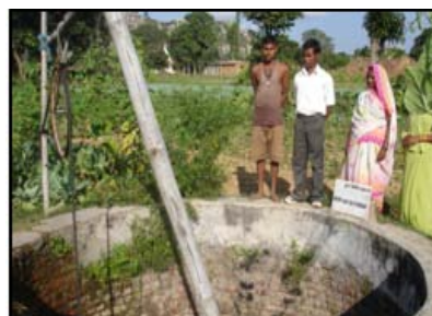
Well of Charan Sahu, Village-Dahu Tola No. of beneficiaries = 6 Area benefitted = 3 acres

The importance of this case study does not lie in mentioning about the construction of irrigation wells, but on the impact that these wells have on increasing the adaptive capacity of the farmers . Earlier farmers were not able to take more than one crop in a year. But now farmers are growing vegetables throughout the year, shifting from the usual kharif crop cultivation . This is possible only due to availability of water in these wells. The production of vegetables is limited, as these farmers have very less land holdings. The surplus produce (of vegetables), which is very little, is being sold by the farmers in the market, directly to consumers. This direct sell fetches a good price, which has improved their economic to a great extent. The average income from each well is approximately Rs. 30, 000 to Rs. 50, 000, per year, depending upon market conditions. It has also reduced the migration of people. Moreover, vegetables in their regular diet have enhanced their nutritional status, especially for women and children. Thus, introduction of just a well, traditional water harvesting system which is very common to all Indian families can lift the economic situation and ensure nutritional security to millions of poor and marginalized farmers and their families. Another important aspect worth mentioning is, water is lifted from the wells by using a bucket and bamboo and rope and no pumps are used . Hence the intervention also addresses the mitigation benefits .