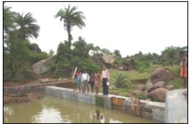
Reservoir of check dam