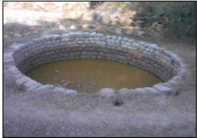
A typical Well in the village Orbenga

In rainy season, ground water level rises up to 2-3 meters in the project area. The periodic recorded groundwater table data indicates increase in overall water level in the area. 40 wells constructed after the intervention are providing water for drinking and irrigation to the villagers. Adjacent to the wells villagers are cultivating vegetables in a properly fenced small land. These wells enabled communities to take up cultivation of Rabi crops as well as summer vegetables. In summer unlike other villages the inhabitants of Orbenga are not facing water crisis. Further, village communities need to be capacitated on managing natural resources in a sustainable manner to improve overall quality of their lives.