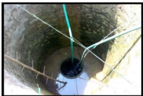
Irrigation well pump

An 8 HP diesel pump is used to lift water from the well. A long pipe of 60.9 Mtrs with 75 mm diameter is used as main pipe and spread in middle of field. From main pipe, small or subsidiary pipe of 30.4 Mtrs long with 60 mm dimension is used to reach the crop root.