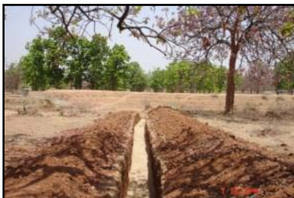
Separate Inlet for diversion of water spillway

In the project area an earthen dam already existed which was being used for irrigation purpose. The dam had very low storage capacity i.e. 100 \times 100 \times 3 \text{m}^3 . Runoff water being stored in this storage area was not found sufficient to meet crop water need in all the villages. The villagers came forward with a request to increase the storage capacity of the dam. In spite of increasing the depth, AFPRO went for an innovative solution by raising the level of existing inlet/outlet of the dam by 1m and also provided a separate inlet to divert water towards the dam.