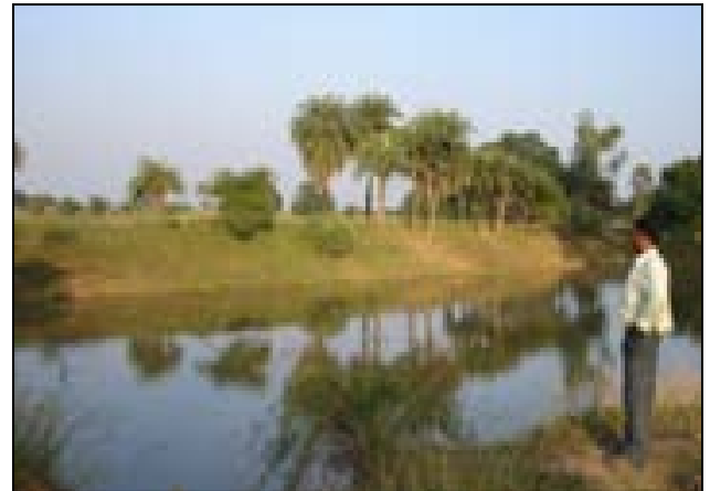
Bandh - Dalgando

Dalgando is a small village located in the district of Giridih in the state of Jharkhand in India. It has a population of about 248 persons living in around 41 households. Agriculture is the main economic activity in the area. Paddy and maize are the main crops grown by villagers. Agro climatic conditions of the area are suitable for cultivation of vegetables. This village comes under rainfed agriculture. Farmers were growing only one crop in year due to lack of irrigation facilities. Villagers were facing problems not only in irrigation; there was lack of drinking water for animals.