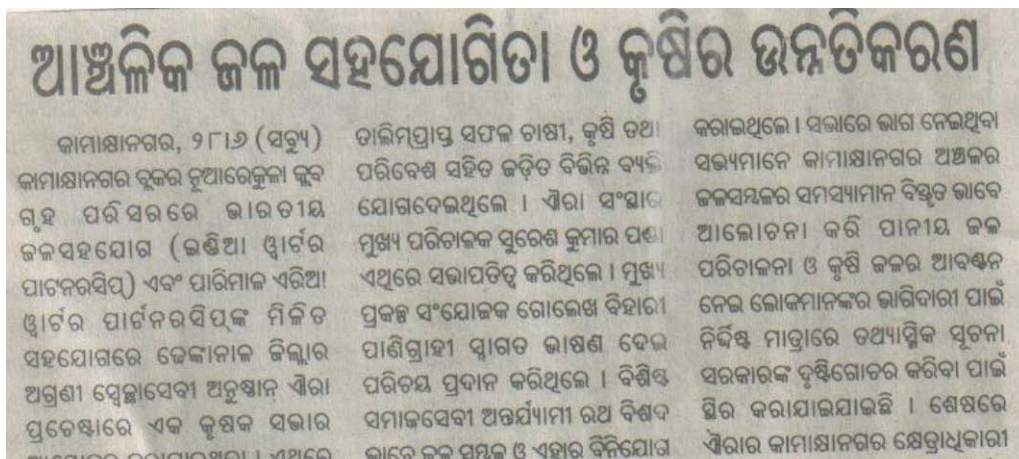
English Version of ‘THE SAMAYA’, Dtd.29/06/11