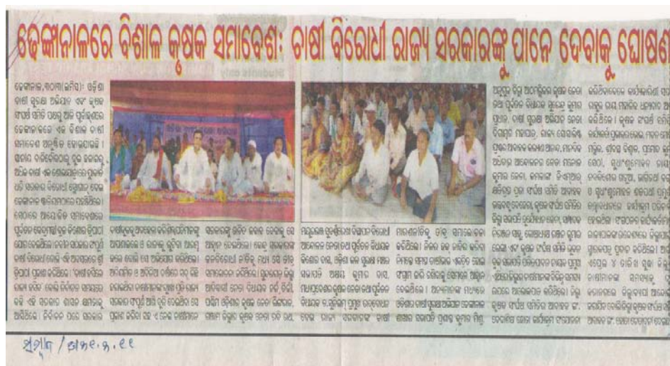
(Farmers Convention at Dhenkanal stadium on water & farm sector issues) (Published in local media SAMBADA on 31/03/2011 in Oriya language)

On 30th March, 2011, PAWP volunteers and AIRA staff were involved in a district level convention of peasants on water and farm sector issues under the title of Krishak Kranti Samabesh. This mega event required elaborate contact and mobilization of peasants, farm-sector workers and community leaders where more than 2000 people were present at the Dhenkanal stadium where the convention took place.