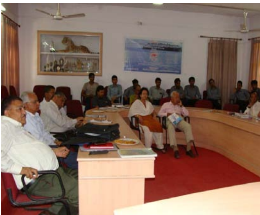
Participants at the Workshop-cum-Seminar