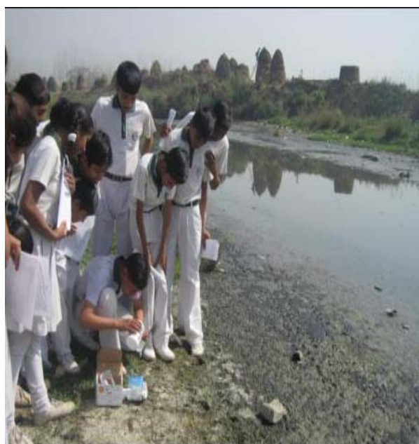
Water testing by students of PGMT International School in Kali River where level of water pollution/contamination is clearly visible

Output/ Outcome : Water audit has played an important role in sensitizing the students, school management staff and also for water management at household level. After these events, other schools have approached the NEER Foundation for installation of rainwater harvesting structures in their premises.