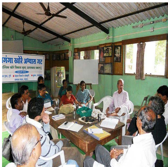
Meeting with Stakeholders regarding types of data to be collected

data like rainfall – autographic rain gauge and standard rain gauge stations, computed discharge, water level, evaporation, daily temperature, humidity, wind speed and wind direction, etc. for various locations in the Wainganga basin since 1994 (or since inception of the monitoring station) has also been obtained. The Watershed maps for the relevant sub-basins of the Wainganga project area have also been obtained.