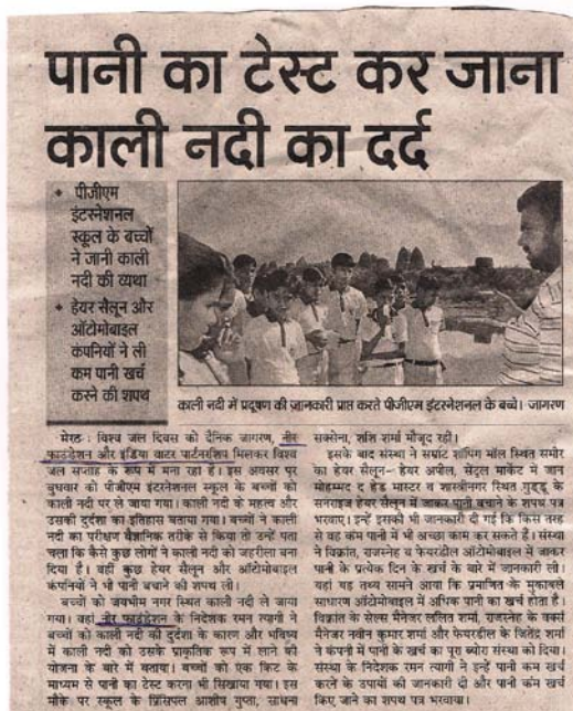
Newspaper cutting : Students of PGMT International School taken to Kali River for water testing

Students of the school were taken to the Kali River in a group accompanied by their teachers. They were educated on the historical importance, present pollution existing in the river, reasons behind the pollution. ‘Seeing is more than believing’, such is the saying. So, the students were also made to test water through water testing kits provided by the organization. They tested the water on few parameters and found the harmful levels of the pollution.