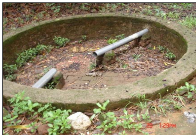
Recharging of a well in Loreto Convent School, Ranchi through roof rain water harvesting

These case studies provide insights on appropriate technological options, process followed for execution and lessons that can be drawn for replication. These cases reflects (i) Ground Water Recharge through Rooftop Rainwater Harvesting - Improving Source Sustainability (Case study of St. Albert's College Ranchi city ), (ii) System of Rice Intensification (SRI) Cultivation: More Rice with Less Water (Case study of Turkatar Village, Balumath Block, Latehar District ), (iii) Increase Storage Capacity of Check dam ensures protective Irrigation (case study of Dasokhap village located in the district of Hazaribag ), (iv) Photovoltaic Water Pumps: Alternative Option for No Electric Zone (Case study of Kanabandh Village, Churchu Block, Hazaribagh ), (v) Drip Irrigation system: Potential Water Saving Agricultural Technique (Case study of Village Gohala, Block Musabani, East Singhbhum ), (vi) Harvest and conserve rainwater for sustainable ground water management (Case study of Loreto Convent School, Ranchi ); (vii) Wells as a feasible mode of harvesting & conserve water (Case study of Orbenga village, Gumla District ) ; and (viii) Water level indicator to save water and electricity (Case study of Ranchi City ).