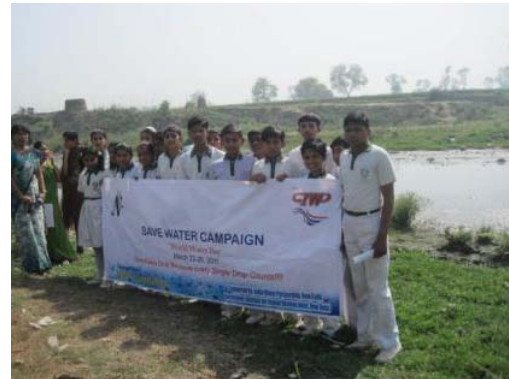
Safe Water Campaign by Students of Meerut on World Water Day

The city of Meerut, Uttar Pradesh (UP) well represents the worsening water scarcity and water contamination. The increasing demand for water gave way to the tube wells which in turn fast depleted the ground water table. The water table has now fallen down below 20 meters. Not only is depleting ground water table, the ground water contamination also another area of concern. Keeping in view the focus of the 2011 theme “Water for Cities: Responding to the urban challenge, the NEER Foundation (IWP partner) with the support of IWP undertook series of events for a period of 5 days commencing from 22 nd March, 2011, the World Water Day by involving greater and active participation of community, school children and the school teachers.