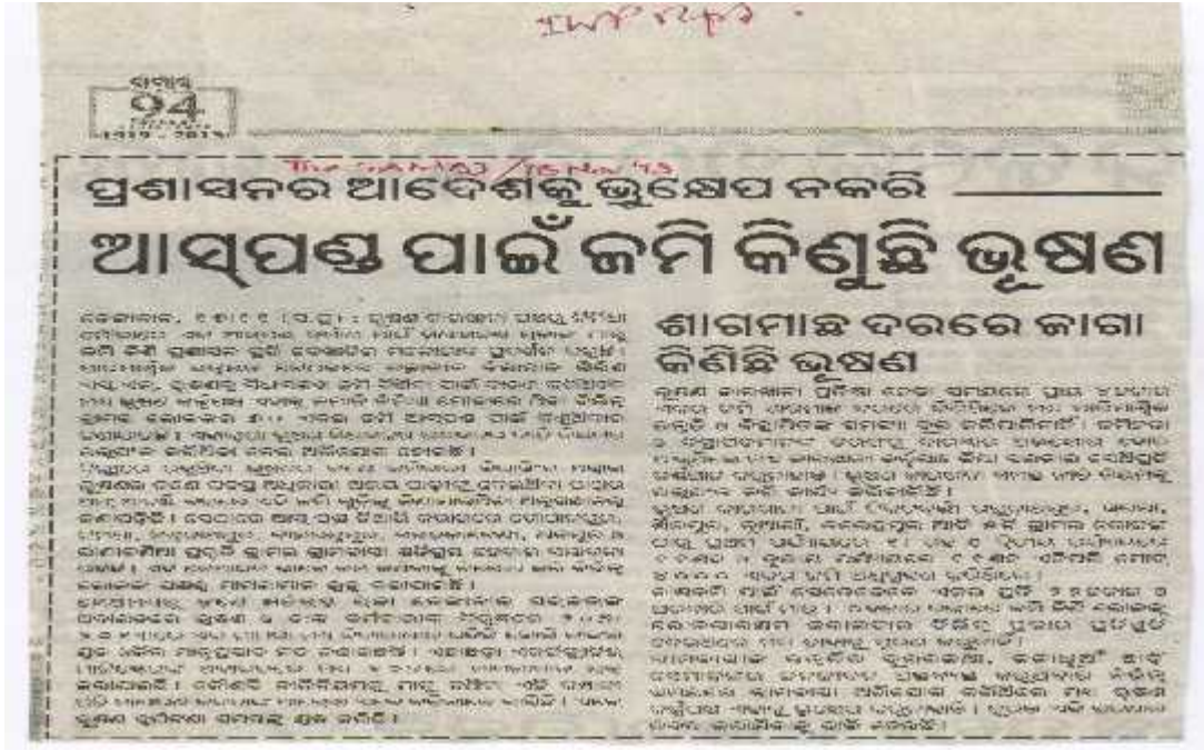
News Item in The SAMAJ/Dt.18 th November 2013