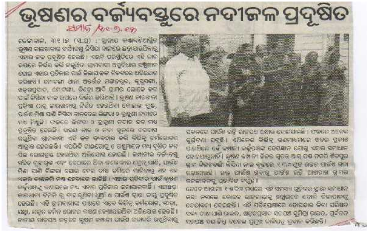
News in The SAMAJ Dated 31.07.2013

Dhenkanal, 31.07.2013 : Water in the Kisinda Nalla is fully polluted with the industrial waste from Bhushan Steel Plant. The local people depending on its water complain before the Collector for immediate remedy. Xxx Industrial waste and ash-slurry from this and other steel, thermal power and other industries gets flown into river Brahmani and Lingiri via Kisinda and other water channels. Xxx The Bhushan industries is yet to construct an ash-pond and by now has dumped dry-ash near Kisinda nalla upto 130 feet height that falls or gets washed into the water channel in rain water or with other liquid waste. People around suffer from air, water and soil pollution especially in the form of skin diseases, stomach & level defects, TB & other pulmonary problems. Xx xx